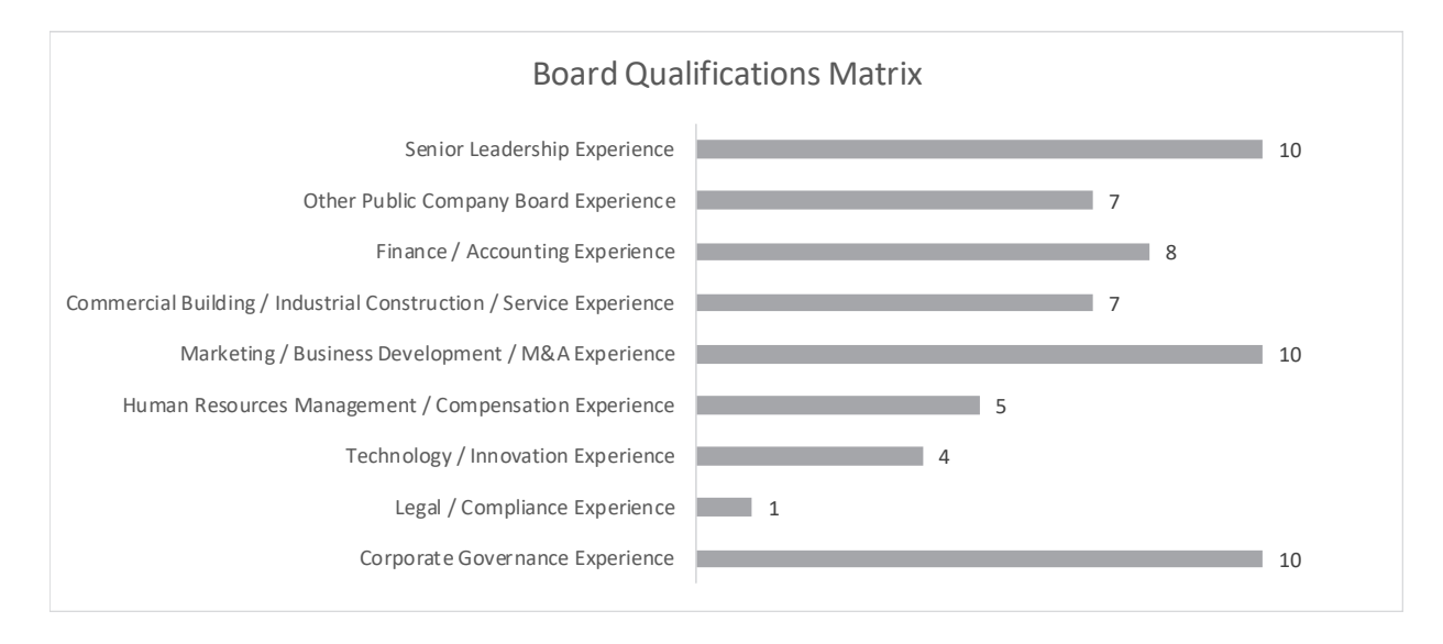
The Board of Directors recommends that stockholders vote FOR the Directors listed above in Proposal Number 1.

The following matrix (1) summarizes desired qualifications, skills and experience, which we believe are appropriate for consideration as we propose leaders to advance our strategy and provide proper oversight, and (2) illustrates the number of Nominees to whom each qualification applies: